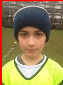
Under 9 Maui Hoete